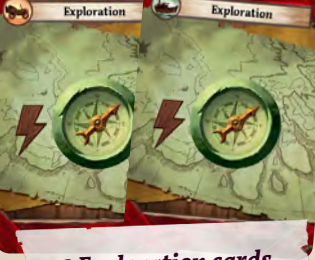
2 Exploration cards