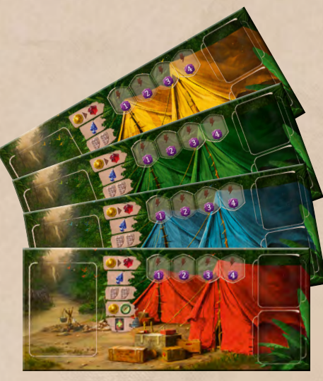
4 double-sided player boards